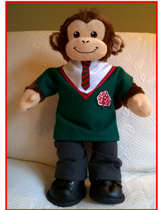
COPA's Attendance Chimp awarded termly to the class with the highest attendance!